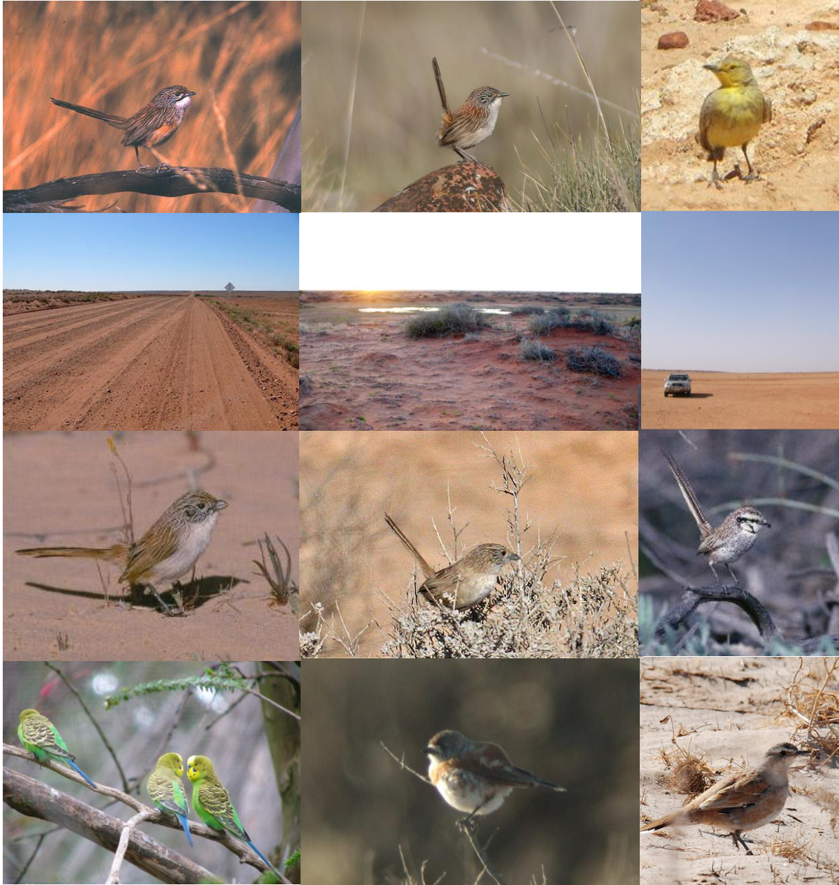
Striated Grasswren, Short-tailed Grasswren, Gibber Chat Strzelecki Track, Mertys, Cameron Corner Eyrean Grasswren, Thick-billed Grasswren, Grey Grasswren Budgerigar, Chestnut-breasted Whiteface, Cinnamon Quail-thrush