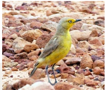
Letter-winged Kite, Flock Bronzewing, Gibberbird