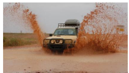
Chestnut-breasted Whiteface, Australian Pratincole, Birding, Black-breasted Buzzard, Wet conditions in the outback