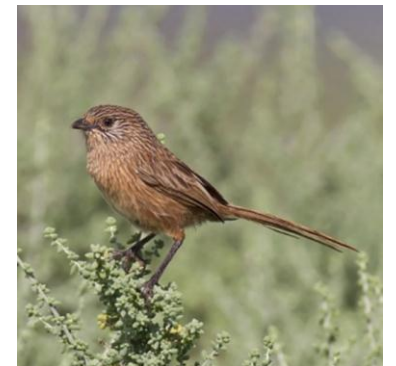
Chestnut-breasted Whiteface, Desert Birding, Crimson Chat, Thick-billed Grasswren

Today we'll say goodbye to our 6-day Highlights tour members, who will bird their way back to Adelaide. We are joined by those participants wishing to do only the second 6-day period and head in the opposite direction to arrive at Hattah-Kulkyne National Park mid-morning. The vast expanses of Mallee scrubland with Spinifex (porcupine) grass here are home to the endangered Mallee Emu-wren. These elusive yet beautiful birds will take some time to track down, but in the process we stand a good chance of coming across Major Mitchell's (Pink) Cockatoo and more Regent Parrots. In the afternoon we proceed to Deniliquin; birding along the way we hope to come across species such as Grey-crowned Babbler and Diamond Firetail. Overnight Deniliquin (Motel; Meals included: B, L, D).