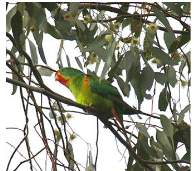
Forty-spotted Pardalote, Swift Parrot