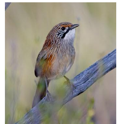
Birding, Regent Parrot, Striated Grasswren

Today we'll travel south past the spectacular rock formations of the Gammon Ranges and enter the Flinders Ranges, an impressive range of steep hills and soaring rock formations on the edge of Australia's outback. Mid-morning we proceed along creekbeds and through narrow gorges cut deeply into geological layers that date back 800 million years. Here we search for Elegant Parrot and Grey-fronted Honeyeater. We visit the fossil site of the Ediacaran fauna, which lived a little before the great explosion of multicellular life at the beginning of the Cambrian Period. Here we're also likely to encounter the endangered Yellow-footed Rock-wallaby. Later we search the spinifex-grass covered slopes for the elusive Short-tailed Grasswren, a recent split from Striated Grasswren and one of SA's endemics. We will certainly see plenty of Red, Western Grey and Euro Kangaroos. Overnight Wilpena Pound Resort . (Meals included: B, L, D).