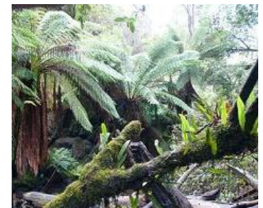
Budgerigar, Great Ocean Road, Tasmanian Native Hen, Tasmanian rainforest

We'll head to the Western Treatment Plant, one of Australia's premier waterbird sites, hoping to find birds like Sharp-tailed Sandpiper, Red-necked Stint, Black-tailed Godwit, Red Knot, Red-capped Plover, Hoary-headed Grebe, Australasian Gannet, Pied, Little Pied, Great & Little Black Cormorants, White-winged Black-Tern, Fairy Tern, Pink-eared, Blue-billed and Musk Duck, Australian Shelduck, Cape Barren Goose, Red-necked Avocet, Australian Spotted Crake, Buff-banded Rail, Blue-winged Parrot, Striated Fieldwren, Horsfield's Bushlark, Horsfield's Bronze-cuckoo, Golden-headed Cisticola, Swamp Harrier and Black Falcon. Overnight Healesville (Motel; Meals included: B, L, D).