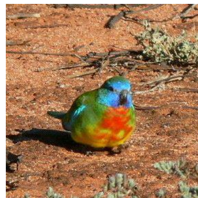
Blue-breasted Fairy-wren, Western Whipbird, Scarlet-chested Parrot

We'll spend the entire morning exploring the the dense scrub surrounding Pt Lincoln's picturesque Lincoln and Coffin Bay National Parks in order to obtain views of Western Whipbird. They are notoriously hard to see, yet relatively easy to hear. Other good species we are likely to come across here are Southern Scrubrobin, Blue-breasted Fairy-wren and Rock Parrot, Western Yellow Robin, Brush Bronzewing, Purple-gaped Honeyeater and Shy Heathwren. Travelling along the coast from Port Lincoln to Ceduna we may see more Banded Stilts as well as Hooded Plover, Osprey, Black-faced Cormorant, Sooty and Pied Oystercatchers, Fairy Tern and Pacific Gulls. Seals and dolphins are often spotted off-shore and we may be lucky enough to see Southern Right Whales. Overnight motel in Ceduna . (Meals included: B, L, D).