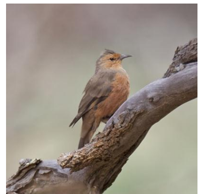
Western Yellow Robin, Western Grasswren, Banded Stilt, Rufous Treecreeper