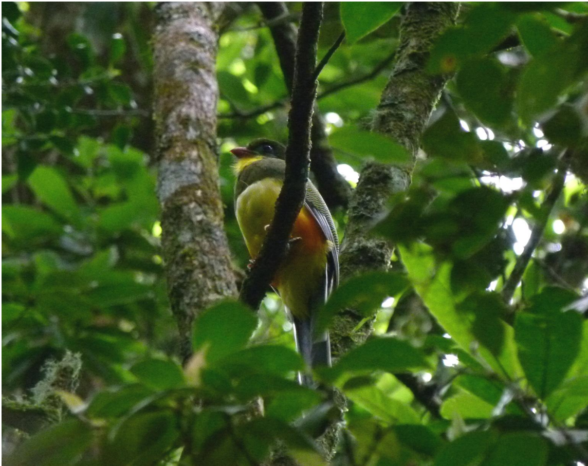
Javan Trogon, Gunung Gede NP, 17 May 2011