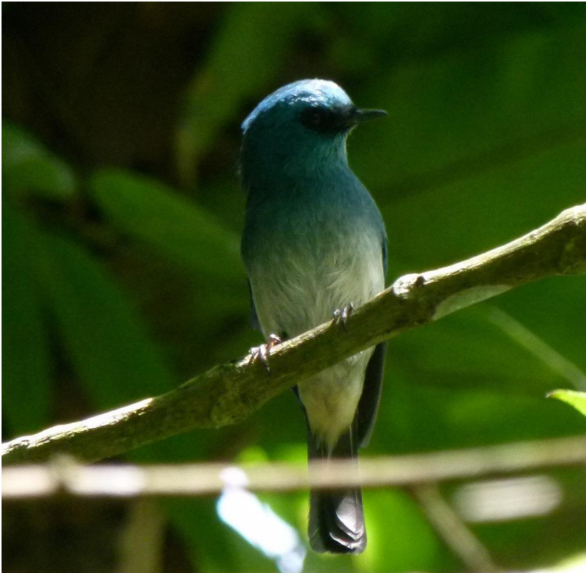
Indigo Flycatcher, Gunung Gede NP, 17 May 2011

Southern Birding Services runs scheduled and custom-made bird tours in Australia and can arrange tours to South-east Asia - visit our website .