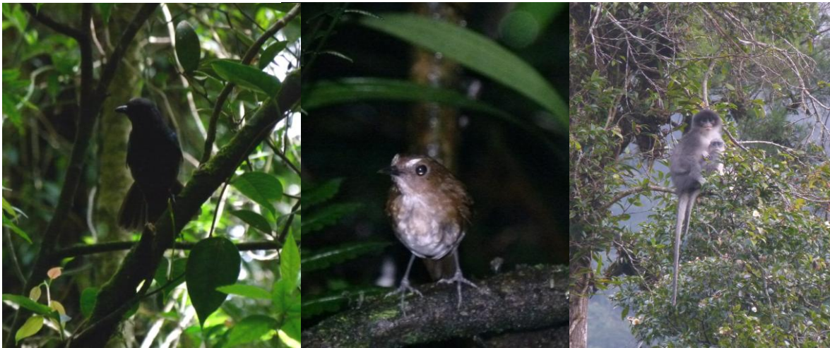
L-R: Javan Whistling-thrush, Lesser Shortwing, Javan Leaf-monkey