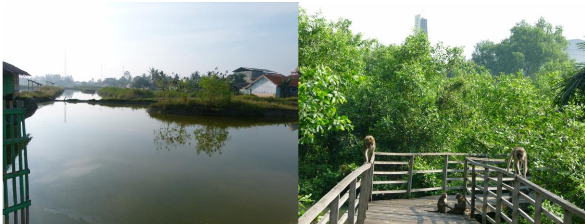
L-R: Pulau Dua, Maura Angke

Muara Angke is a small, protected mangrove forest in Jakarta. It is a quiet haven surrounded by busy streets and roads and suburbs. It is a well-known site for Sunda Coucal; Sunda Pygmy Woodpecker can also be seen here. There is also a wetland here that used to hold Sunda Teal but has recently become completely overgrown with Water Hyacinth. There are Oriental Darter roosting in the trees here and Black-crowned Night-heron, Yellow Bittern, Purple Heron, Grey Heron, White-browed Crake, Pied Fantail and many other species. The site is accessible by means of a boardwalk that leads through the mangrove forest and around the edge of the wetland.