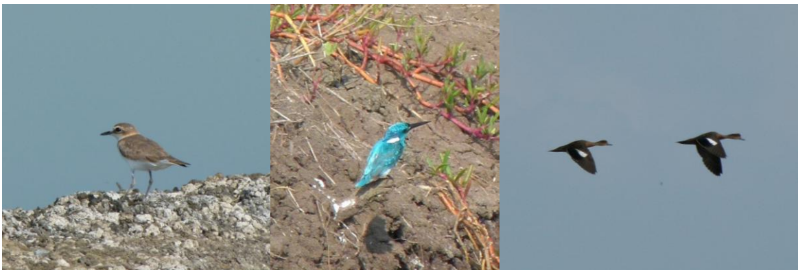
L-R: Javan Plover, Small Blue Kingfisher, Sunda Teal