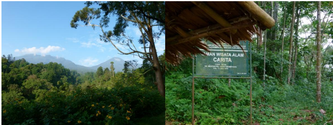
L-R: Gunung Gede - Pangrango, Caritas Forest Reserve

Caritas Forest Reserve is a lowland rainforest close to the beach resort town of Caritas, about 3-4 hours drive from Jakarta. The main birding is along a 3.5 km long trail that leads to a waterfall. The forest is mixed production and unspoilt lowland tropical forest. The forest is a bit more open than at Gunung Gede. Target species here include Banded Pitta, Black-banded Barbet, Scaly-crowned Babbler, Grey-cheeked Tit-Babbler, Black-capped Babbler, Sunda Woodpecker and in the evening Javan (Barred) Owlets and Sunda Scops Owl.